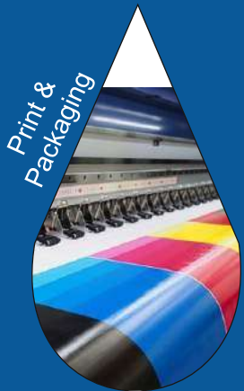
Print & Packaging