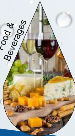
Food & Beverages